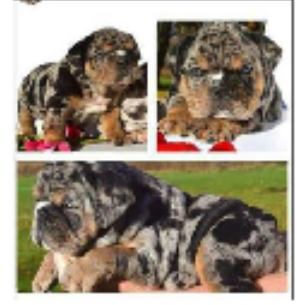
Blue Merle Tri-Color

This color phenomenon is fairly recent, appearing within the last 10 years or so. The problem stems from unscrupulous breeders and AKC's practice of registering these Non-Standard colors. While the paper registration form shows correct colors for our breed, the online registration form includes a whole host of additional colors. When and how did that happen? Why did AKC change the online registration process to include Non-Standard colors? Why does the Bulldog Breed Information page on the AKC website show both "Standard" and "Non-Standard" colors and markings? Perhaps, it has always been like this, and no one noticed? Questions need to be answered.