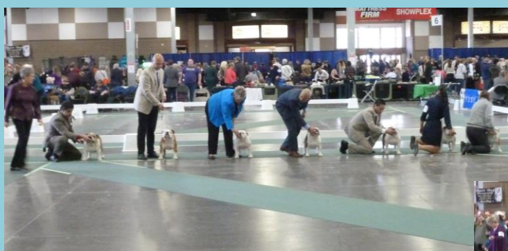
2018 Western Washington Cluster Puyallup WA Best of Breed Competition

***Venue rentals for SKC Breed Booth & Halloween Party