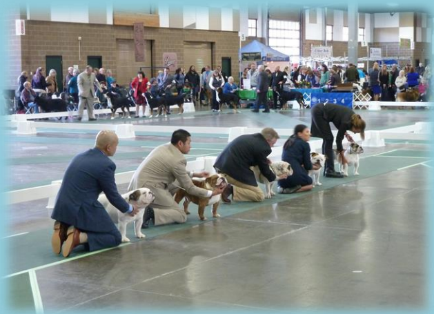
2018 Western Washing Cluster Puyallup WA Winner's Dog

Reminder that the February BCGS Club meeting will be held on Saturday, February 3, 2018 at Berliner Pub, 221 Main St, Renton WA Starting at 3:00. The pub is family and dog friendly so come and join us!!