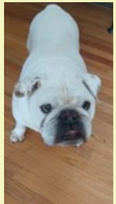
...and Winnie looking terrific at 14.5!