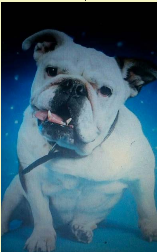
Meatball in her prime...