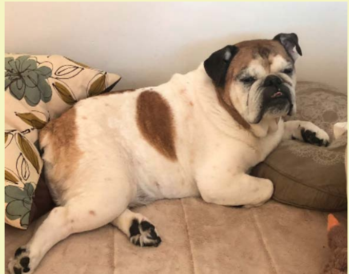
Stella, still looked amazing at 14.5 years old!